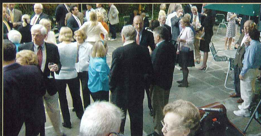
Party-goers enjoyed a beautiful New York City evening on the River Club's patio.